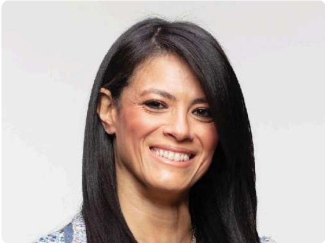
H.E. Dr. Rania Al-Mashat

H.E. Dr. Rania A. Al-Mashat is an accomplished economist and public policy leader with over 20 years of international experience spanning central banking, monetary policy, sustainable development, and climate finance. Currently serving as Egypt's Minister of Planning, Economic Development, and International Cooperation, she has held prominent roles including Egypt's Minister of International Cooperation (2019–2024) and the first female Minister of Tourism (2018–2019).