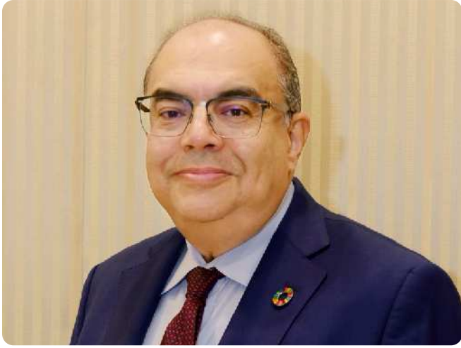
Dr. Mahmoud Mohieldin

Dr. Mahmoud Mohieldin is an economist with more than 30 years of experience in international finance and development. Dr. Mohieldin is the UN Climate Change High-Level Champion for Egypt. He has been the United Nations Special Envoy on Financing the 2030 Sustainable Development Agenda since February 2020. He also served as the Executive Director at the International Monetary Fund representing the Arab States and The Maldives. Previously, Dr. Mohieldin was the Minister of Investment of Egypt from 2004-2010, and more recently, served as the World Bank Group Senior Vice President for the 2030 Development Agenda, United Nations Relations and Partnerships.