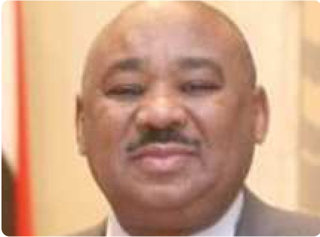
Dr. Ibrahim Elbadawi

Ibrahim Elbadawi is the Managing Director of the Economic Research Forum (since January 2017-August 2019; August 2020- present). Minister of Finance and Economic Planning, Republic of Sudan (Sept 2019-July 2020). Professor Emeritus, University of Khartoum. Before that he was Director at the Economic Policy & Research Center, the Dubai Economic Council (2009-2016); Lead Economist at the Development Research Group of the World Bank, which he joined in 1989; and Professor of economics at the University of Gezira in Sudan. He holds a PhD in economics and statistics from North Carolina State and Northwestern universities in the USA. During his work at the World Bank he also served as Research Director of the African Economic Research Consortium (Nairobi, 1993-1998), on external leave from the Bank.